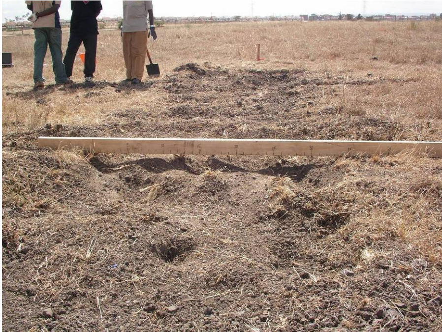
Figure 6: Poor hammer penetration in hard surface