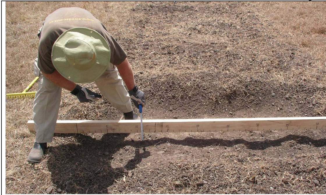
Figure 1 – Measuring ground penetration depth directly