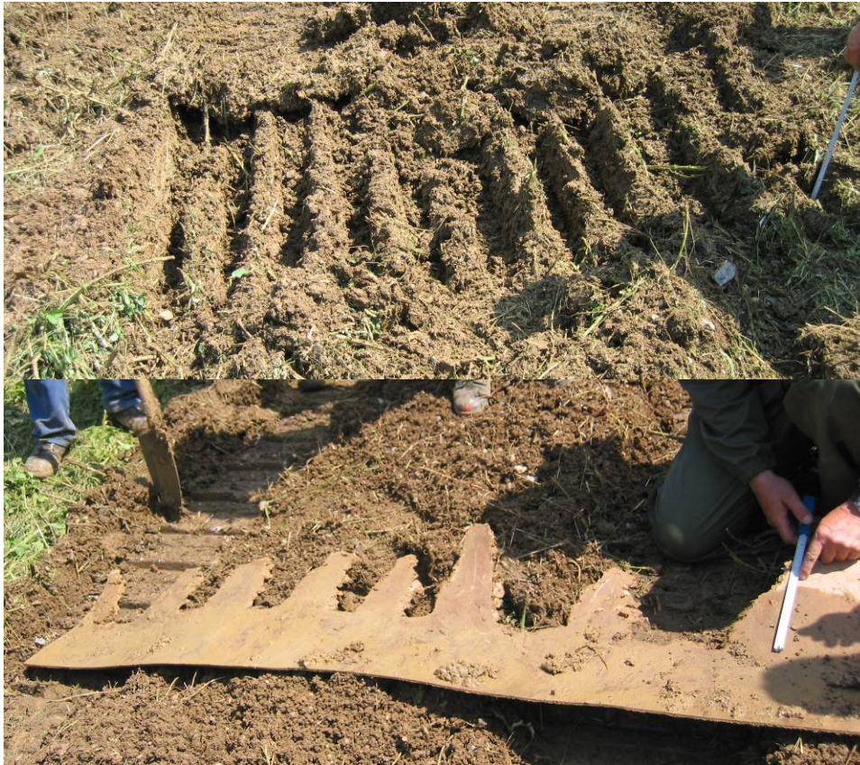
Figure 2 – Measuring ground penetration depth indirectly using fibreboards

Proper installation of fibreboards is critical in order to obtain a realistic representation of the ground penetration depth of the machine tool. While simple in concept, the use of fibreboards can be difficult in practice, especially outside of test facilities where certain equipment is available. In the background discussion above, it was stated that it is important to avoid creating a soft zone in the area where you are trying to make measurements. Intuitively this makes sense, but the importance is often overlooked when fibreboards are placed for a test.