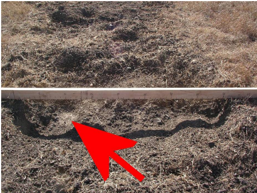
Figure 7: Deep Hammer Penetration in Soft Holes