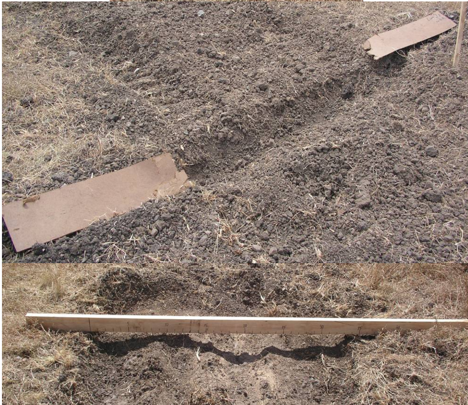
Figure 4 – Improper fibreboard installation producing misleading results.