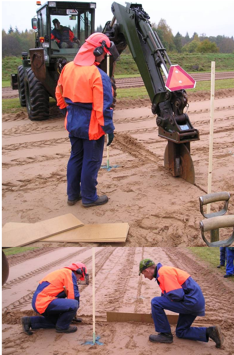
Figure 3 – Proper fibreboard installation